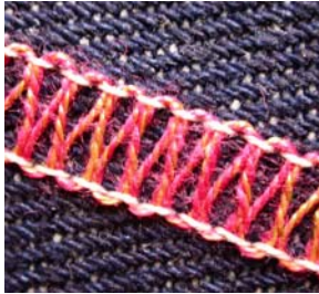
These are the same colors reversed