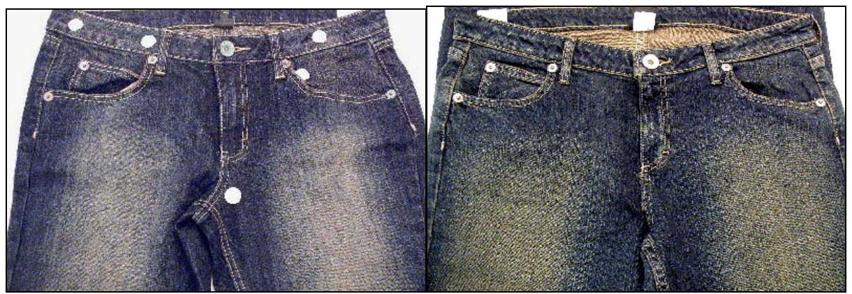
Broken stitches or repairs using spun poly

There is no perfect sewing thread for all sewing applications. Obviously from the information discussed above, corespun threads are clearly superior sewing threads when compared to spun polyester sewing threads. On performance garments, this will definitely make a difference in the quality of your finished product.