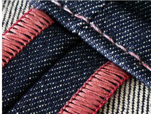
Compact Serging @ 16 spi

Regular Serging @ 8 spi But with 2 ends in the Upper Loooper