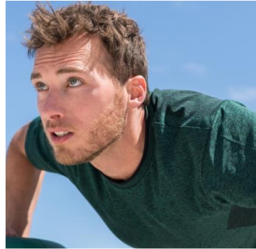
Ideal for Activewear, Athleisure, and Fine Tex Size Applications

3 rd party SCS certification of the raw materials ensures you can Complete your Sustainability Story in your next garment with fabric AND sewing thread using REPREVE recycled fiber from A&E and Unifi Manufacturing, Inc.