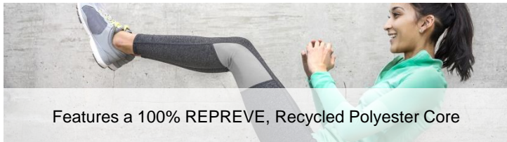
Features a 100% REPREVE, Recycled Polyester Core

*Physical characteristics provided are for comparative purposes only, final determination of suitability is the sole responsibility of the user. All physical data shown is based on current averages and should not be used as minimum requirements.