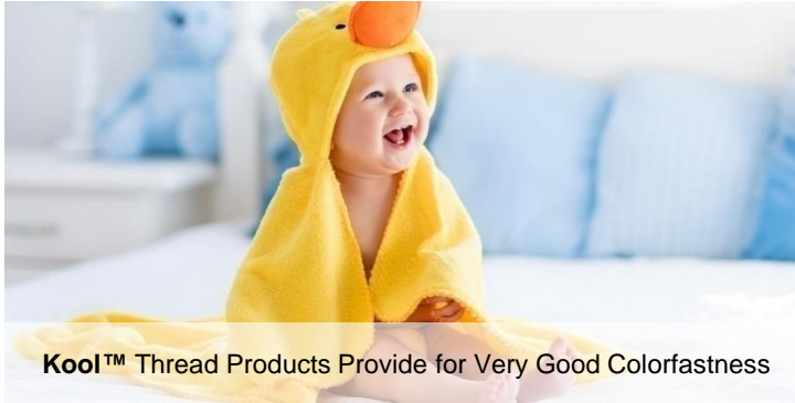
Kool™ Thread Products Provide for Very Good Colorfastness