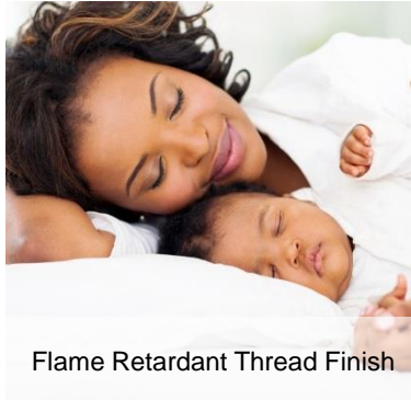
Flame Retardant Thread Finish