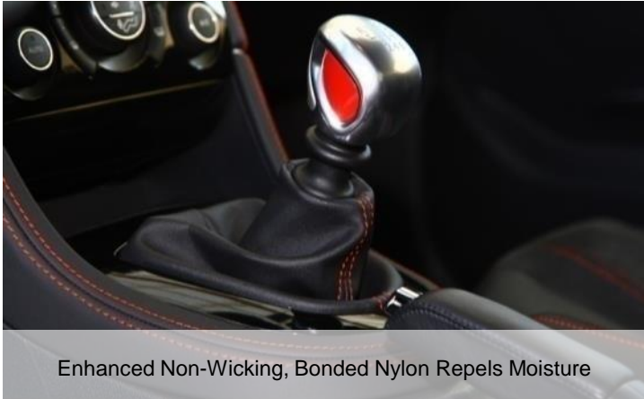
Enhanced Non-Wicking, Bonded Nylon Repels Moisture