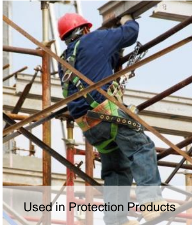
Used in Protection Products