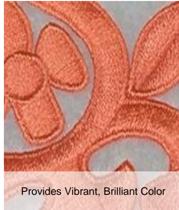
Provides Vibrant, Brilliant Color