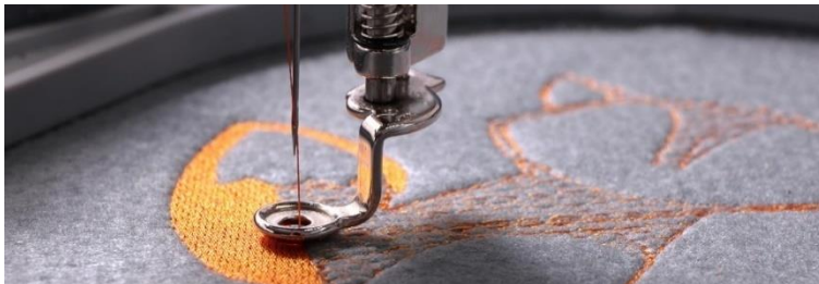
Premium, Versatile Polyester Thread for All Embroidery Applications

*Physical characteristics provided are for comparative purposes only, final determination of suitability is the sole responsibility of the user. All physical data shown is based on current averages and should not be used as minimum requirements.