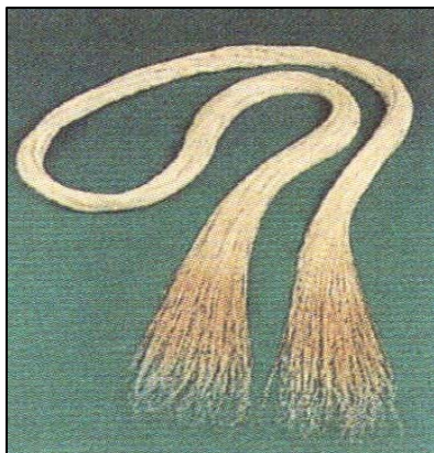
SKEINS WITH PRE-TAPERED ENDS