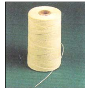
SINGLE END TUBE

For information or samples, contact your local A&E Representative American & Efirid Inc 22 American Street, Mt. Holly, North Carolina 28120 (800) 438-5868 / Fax: 704-827-0974 Website: www.amefird.com