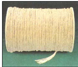
24 END REEL