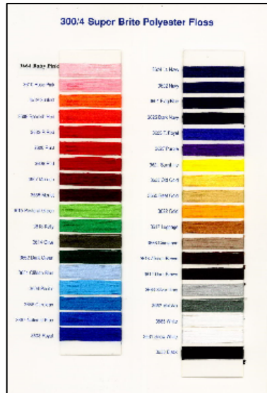
Polyester Floss Color Card

Application: Not an embroidery thread. For merrowing edges of patches and for providing a distinctive topstitching appearance.