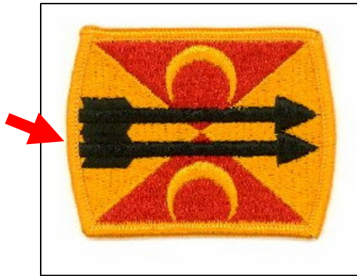
ISO505 Overedge Thread also referred to a Merrow Stitch