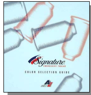
Signature Color Card