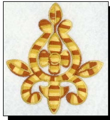
3 Color Combination

A&E Embroidery Threads By Robison - Anton®