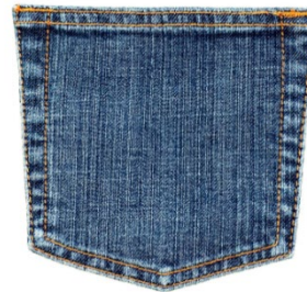
Un-stretched Denim Pocket