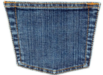
Stretched Denim Pocket